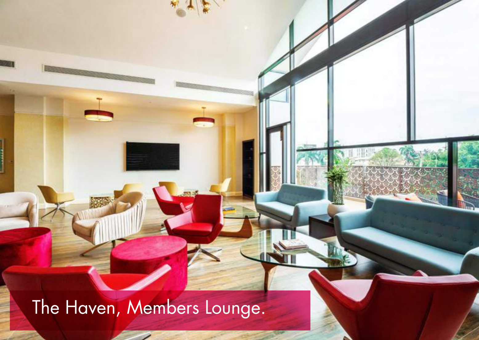
The Haven, Members Lounge.