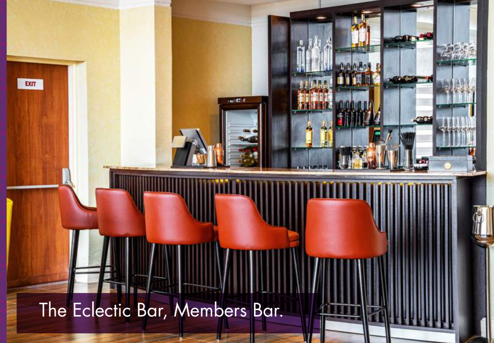
The Eclectic Bar, Members Bar.