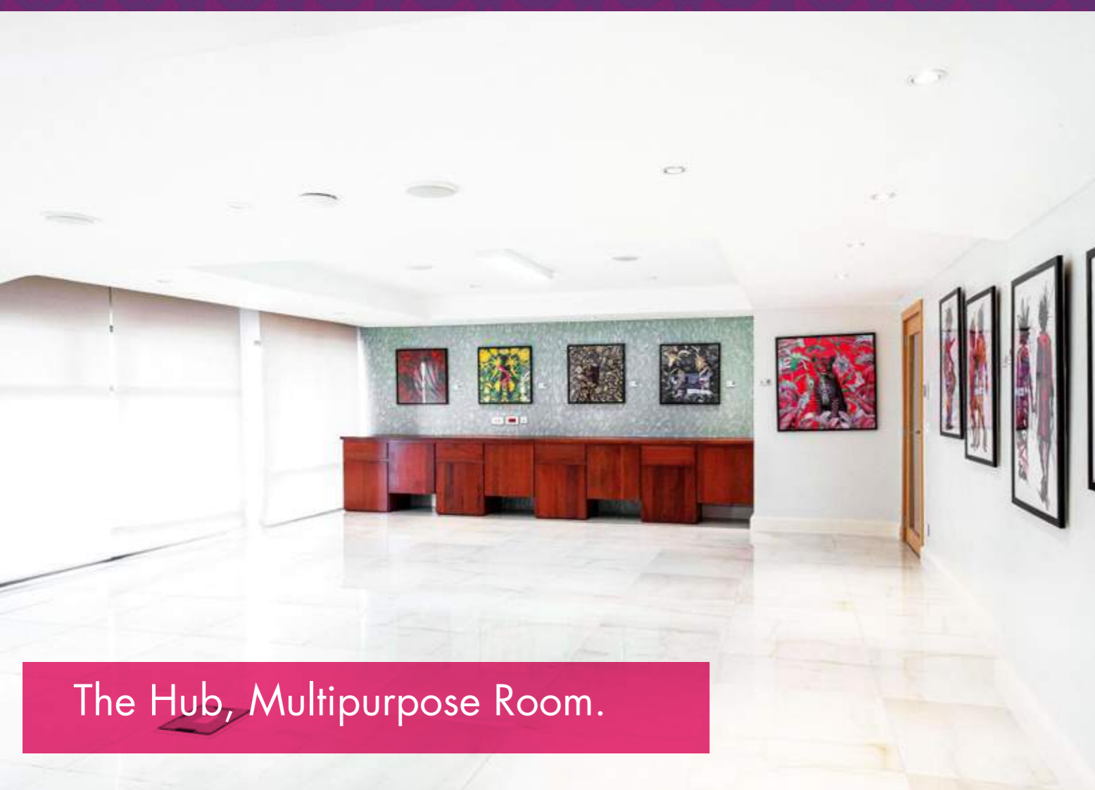
The Hub, Multipurpose Room.